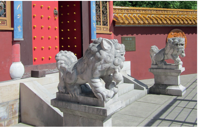
The pair of quotes on the left and right of the main gate summarises the geographical location of Kunming between the «Mountain of the Golden Horse» (in the East) and the «Mountain of the Jade-green Cock» (in the North).

More than 500 landscapes and still lives adorn the open gallery. The carved semi-arches on their traverse beams are a special feature of the gardens in Yunnan. A short, winding path invites visitors to stroll past the bamboo grove and up to the moon gate. Its round shape symbolises abundance and harmony.